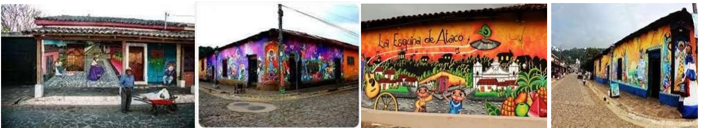
Ruta de las Flores El Salvador