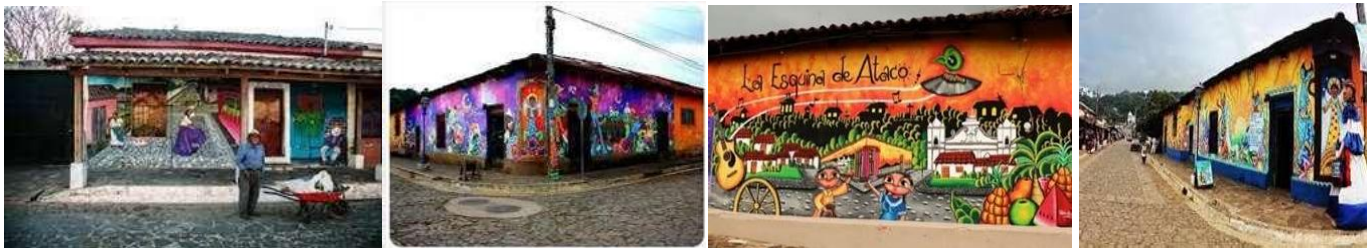
Ruta de las Flores El Salvador