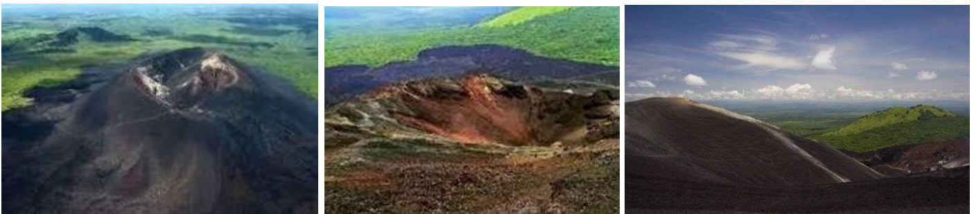
Cerro Negro Tour